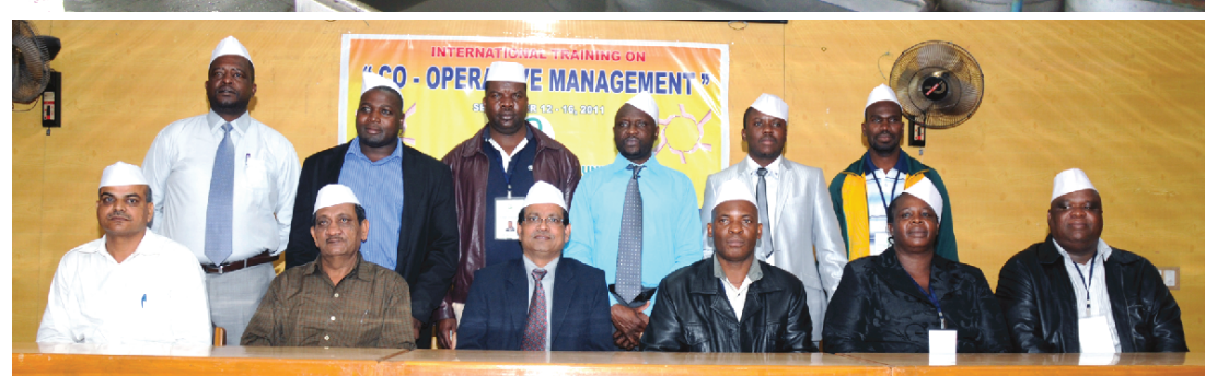
GLIMPSES OF INTERNATIONAL TRAINING PROGRAMME ON COOPERATIVE MANAGEMENT: SEPTEMBER 12-16, 2011