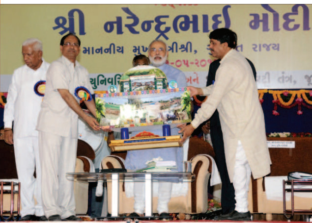
Hon'ble Chief Minister of Gujarat, Shri Narendrabhai Modi, inaugurated Agri. Fair ( Krushi Mela ) at Una organized during May 27-28, 2011 under Krushi Mahotsav -2011