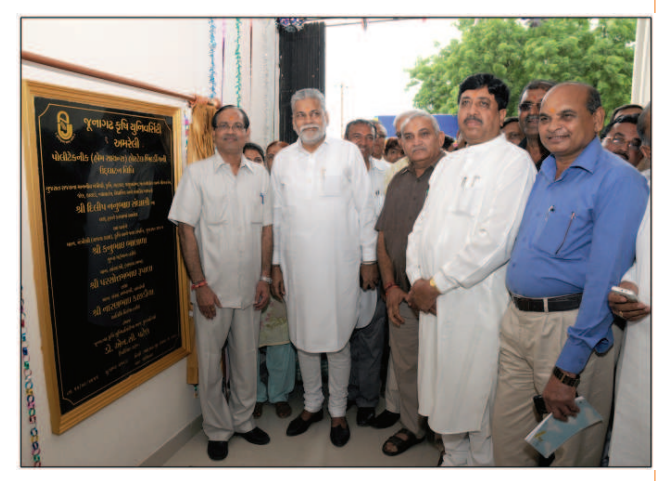
Inauguration of Polytechnic in Home Science College and Hostel Building at Amreli on September 10, 2011