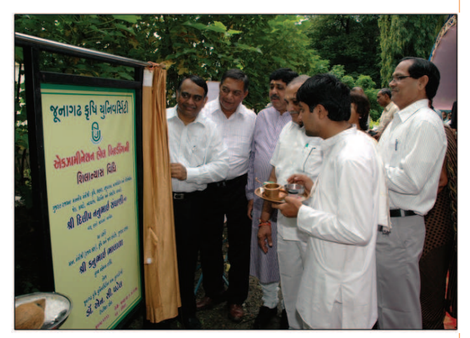
Foundation Stone Laying Ceremony of Examination Hall on August 14, 2011